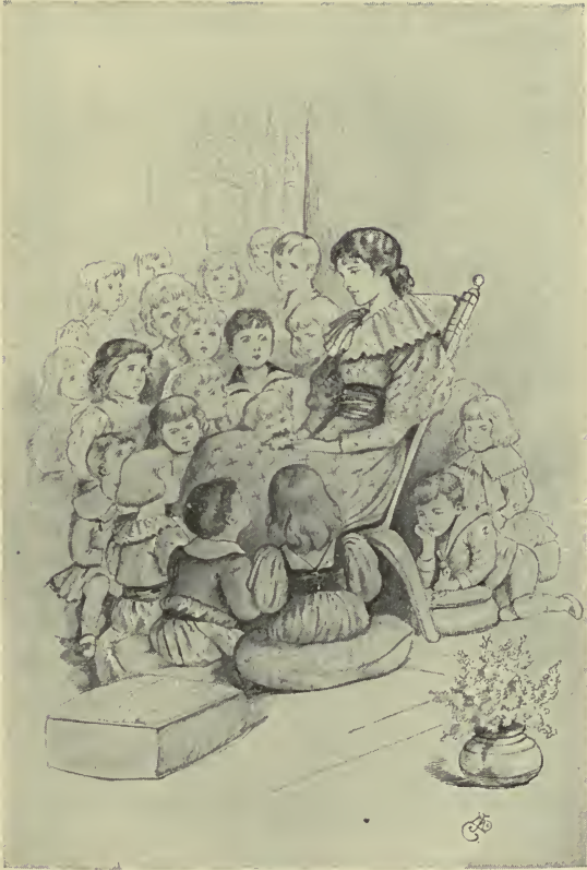
TELLING THE LILAC-BUSH STORY